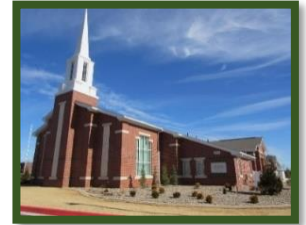
15700 N. Pennsylvania

Not scared yet? The Edmond Genealogical Society will present a very spooky edition of “ Genealogy / Halloween Jeopardy ” at our October meeting.