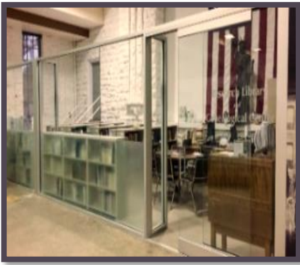
Genealogical Library at Edmond History Museum